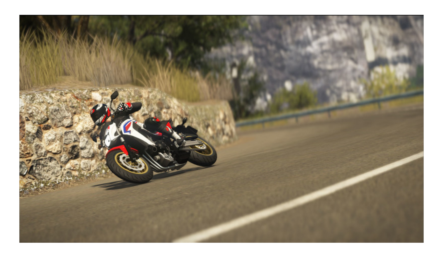
Ride 2 Free Bikes Pack 6 Activation Code And Serial Number

Download >>> <a href="http://bit.ly/2SVcElb">http://bit.ly/2SVcElb</a>